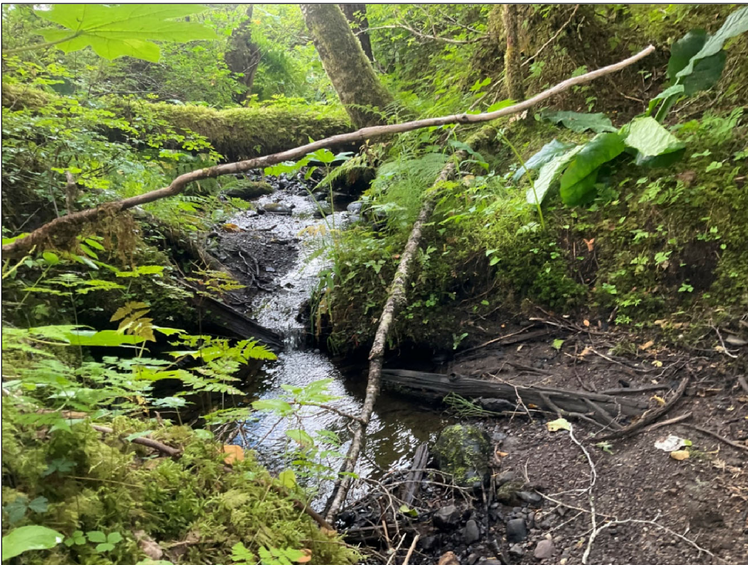
Figure 4.—Streamflow going subterranean at waypoint 1575.