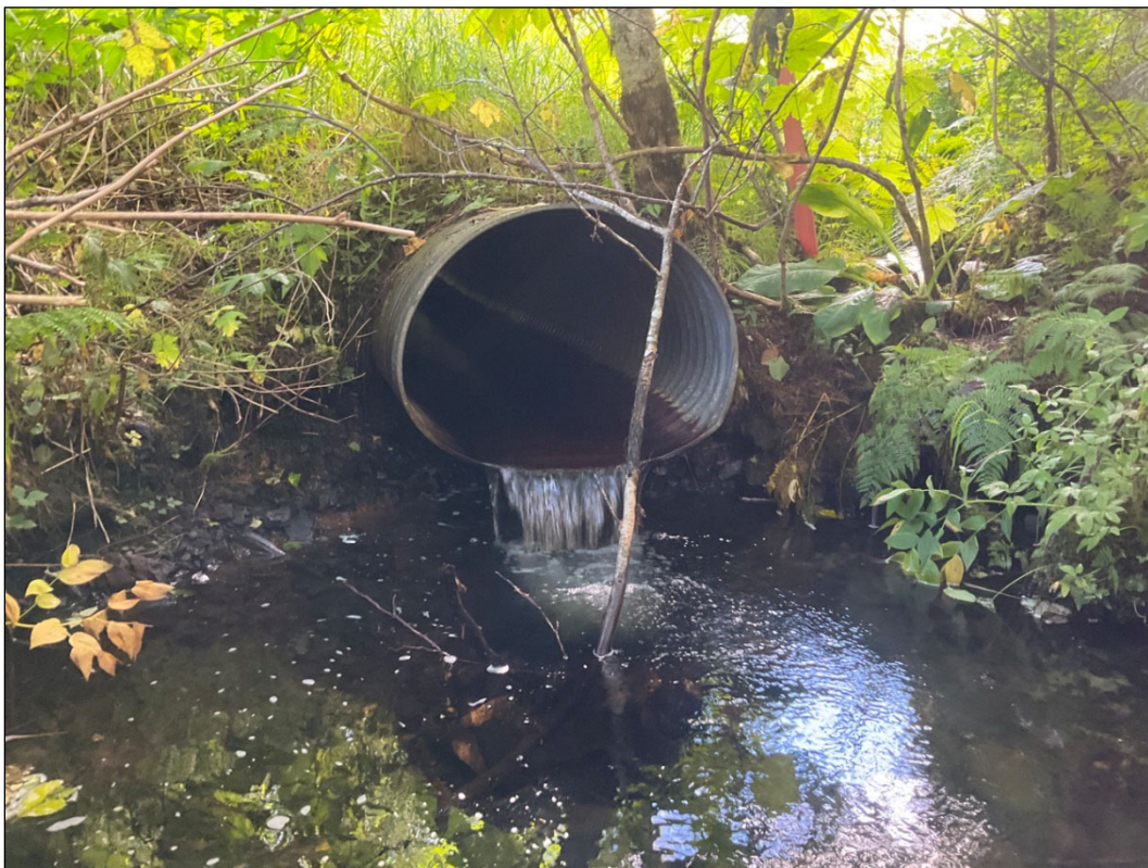
Figure 2.—Perched culvert outlet at waypoint 1561.