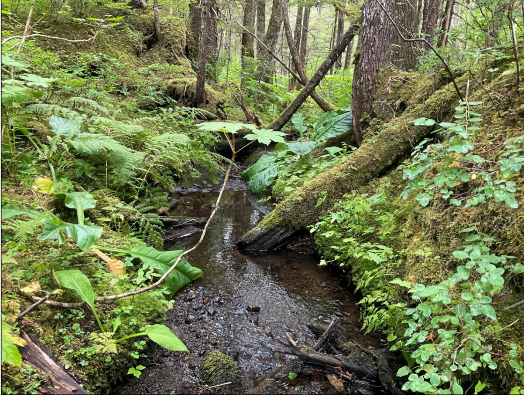
Figure 3.—Tributary 1 just downstream of subterranean flow at waypoint 1575.