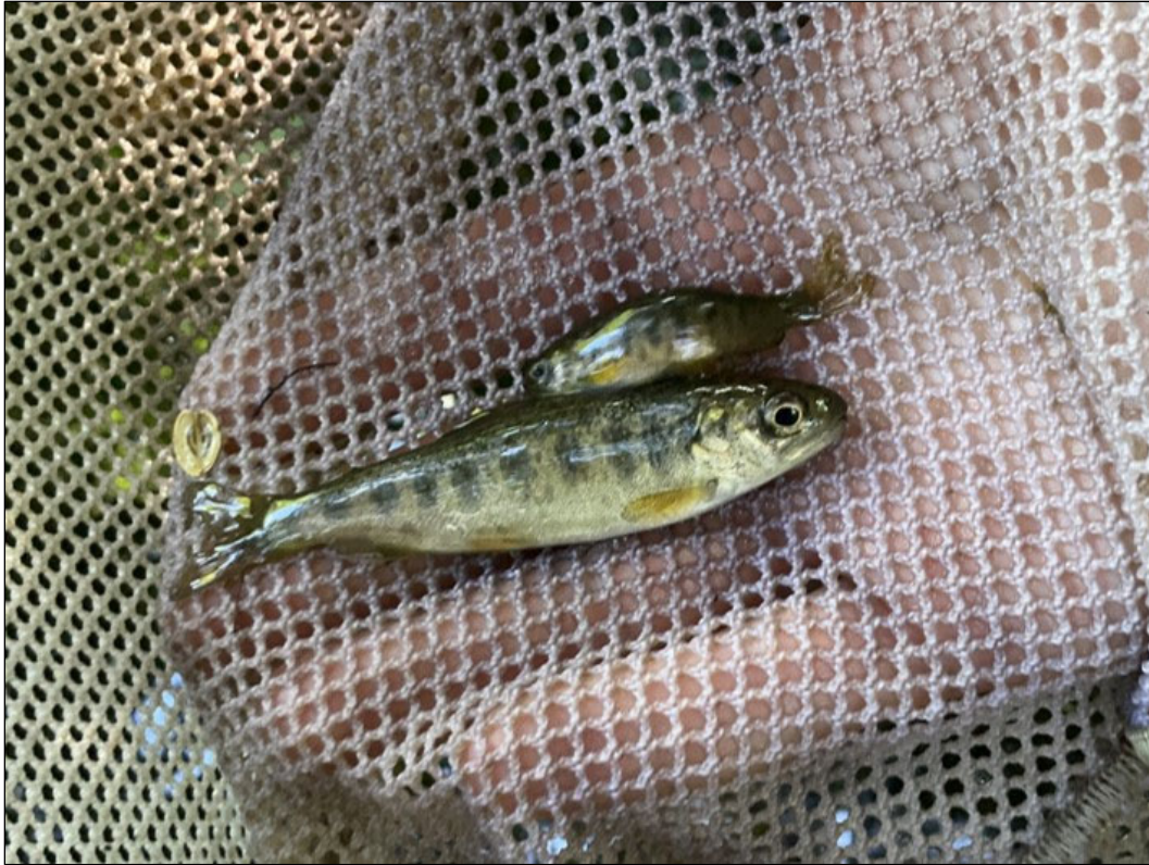
Figure 1.—Juvenile coho salmon captured at waypoint 1561.